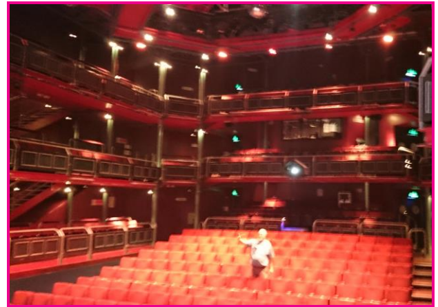
The South Hill Park Arts Centre, Bracknell