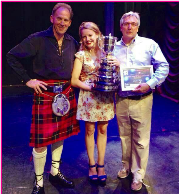
2015 British Final Winners - Kirkintilloch Players

The whole week-end was very well organised and the venues and welcome were great. It was such an enjoyable time for all of us and we were so privileged to be part of it.